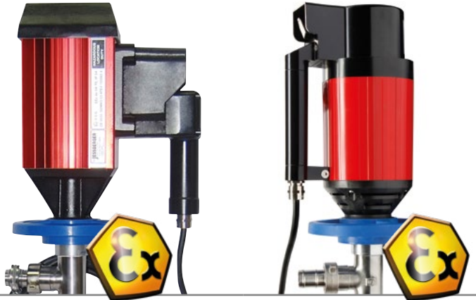
Electric drum pump JP-400 motor with pump tube (41 mm)