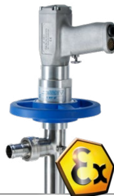
Air operated drum pump JP-Air 2 motor with pump tube (41 mm)