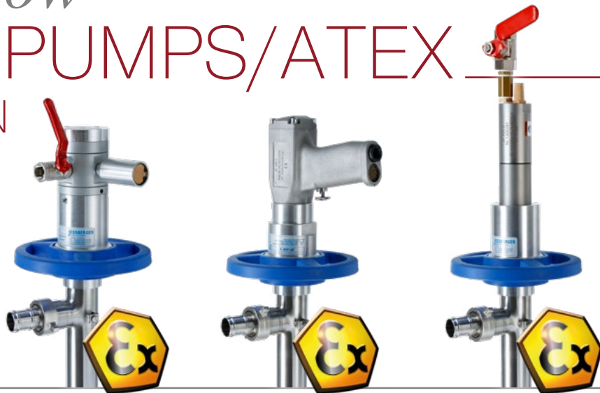
Air operated drum pump JP-Air 1 motor with pump tube (41 mm)