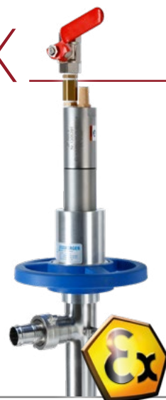
Air operated drum pump JP-Air 3 motor with pump tube (41 mm)