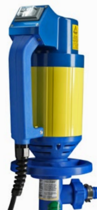
Electric drum pump JP-160/JP-180/JP-280 motor with pump tube (41 mm)