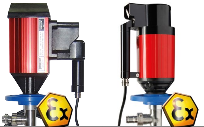
Electric drum pump JP-400 motor with pump tube (41 mm)