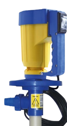
Electric laboratory pump JP-120/JP-140 motor with laboratory pump tube (25-32 mm)