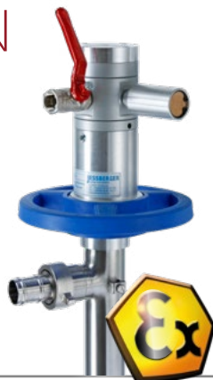
Air operated drum pump JP-Air 1 motor with pump tube (41 mm)